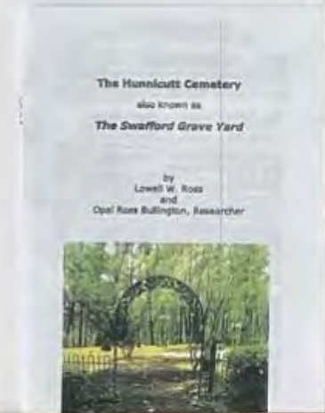
Brochure featuring stories about people buried in Hunnicutt Cemetery