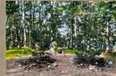
Beautification of Hunnicutt Cemetery before family visit