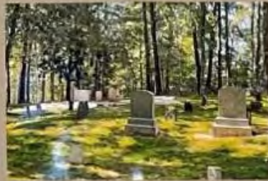
Dappled light streams gently across moss and tombstones

BY MEMBERS OF THE BECK, SWAFFORD AND HUNNICUTT FAMILIES