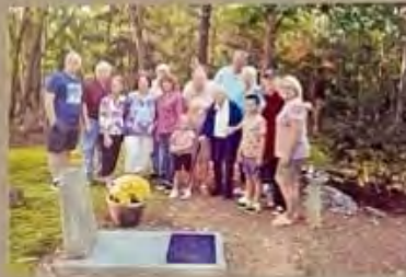
Family members, ranging in age from 100 years old to under 10 years old at Hunnicutt Cemetery September 23, 2022