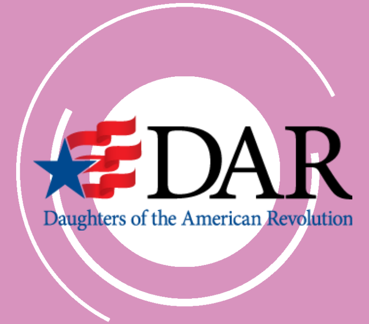
Member of DAR and Society of Mayflower Residents