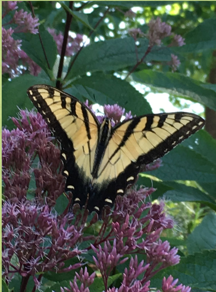
Swallowtail on Joe Pye Weed