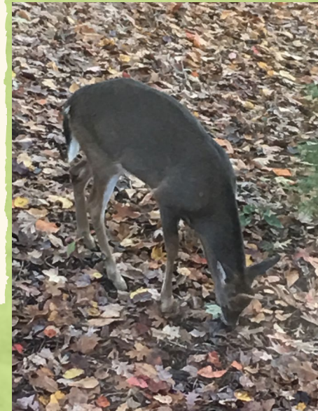
Deer eating acorns