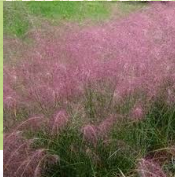
Pink Muhly Grass