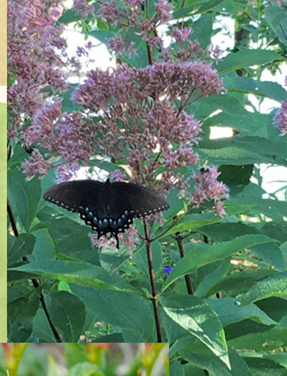
Joe Pye Weed