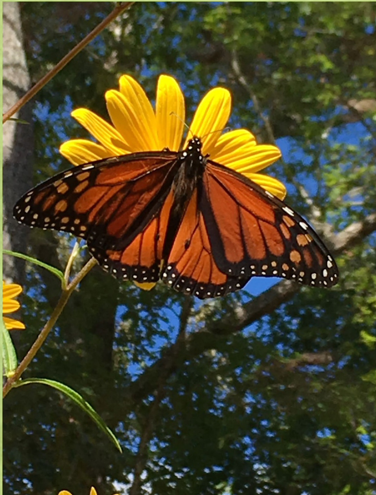
Monarch on swamp sunflower