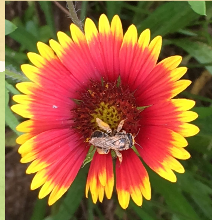
Indian Blanket Flower