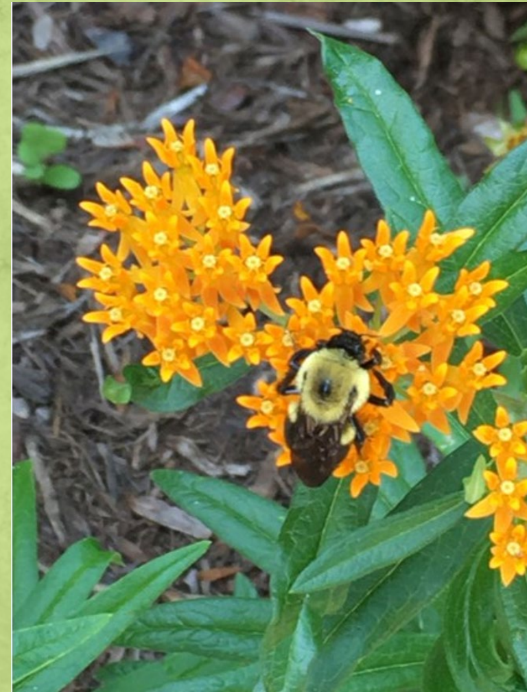
Bumblebee on native milkweed