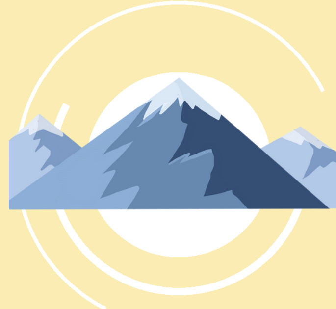
Driving through the Mountains