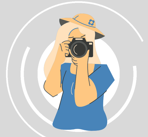
Scrapbooking, photography, knitting, cooking, baking