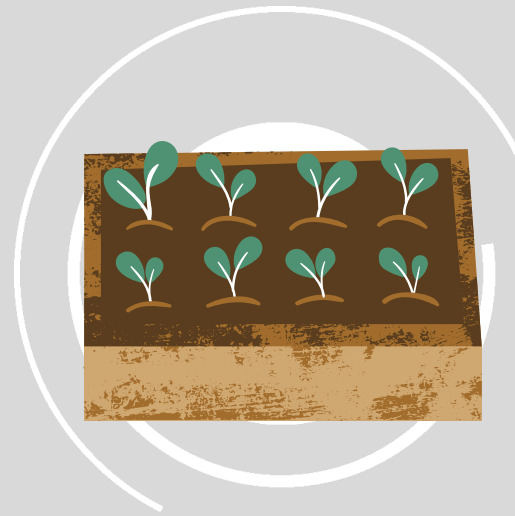
Herb / Vegetable Gardens