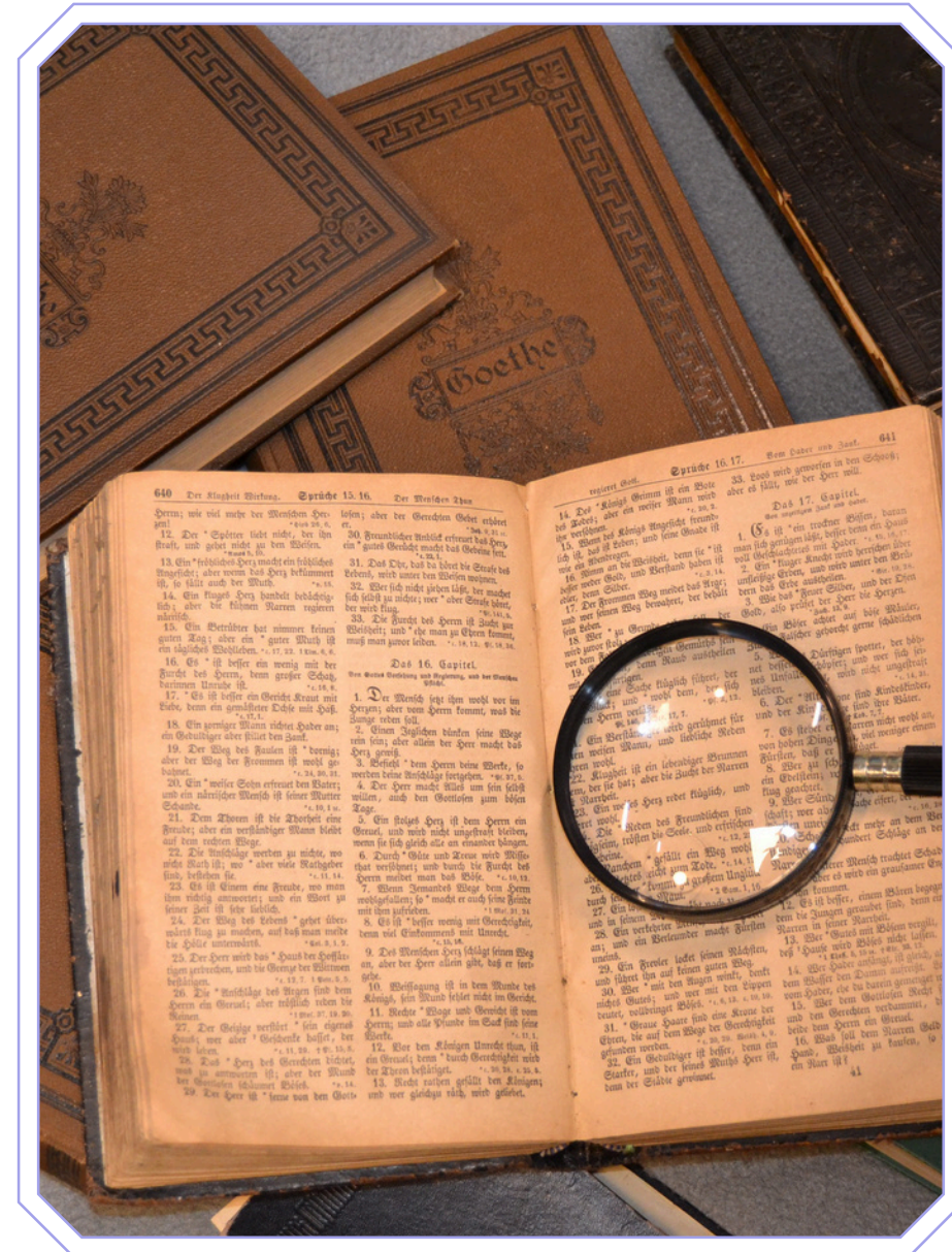
2 Upstate Historical Seekers