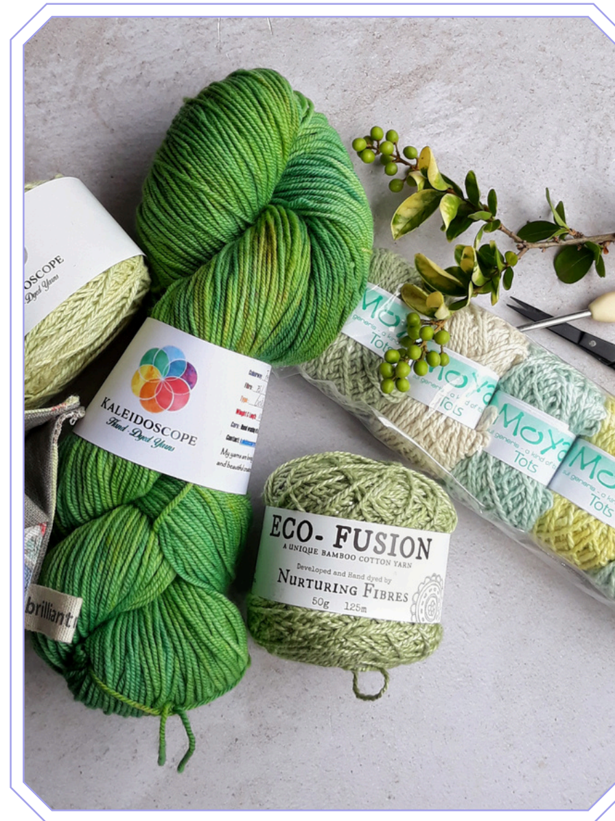
1 Keowee Krafters