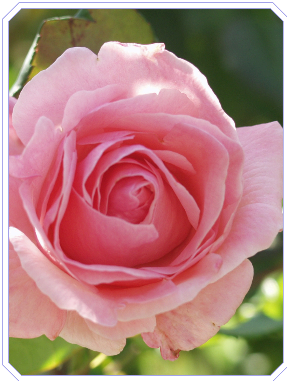
6 Rose Gardens