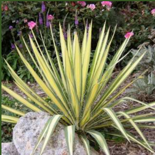
Colorguard Yucca Yucca filamentosa 'Color Guard'