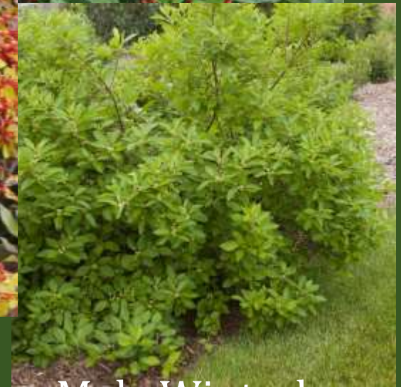
Winter Red Winterberry Ilex verticillata 'Winter Red'