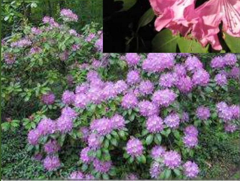
Catawba Rhododendron Rhododendron catawbiense