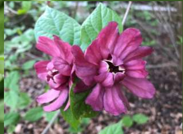
Aphrodite Sweetshrub Calycanthus floridus 'Aphrodite'