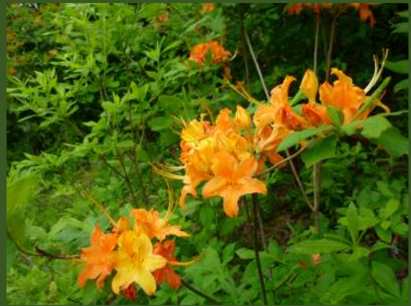
Flame Azalea Rhododendron calendulaceum