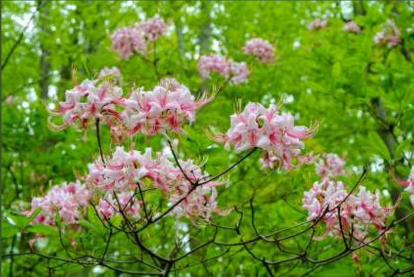
Pinxter Rhododendron Rhododendron periclymenoides