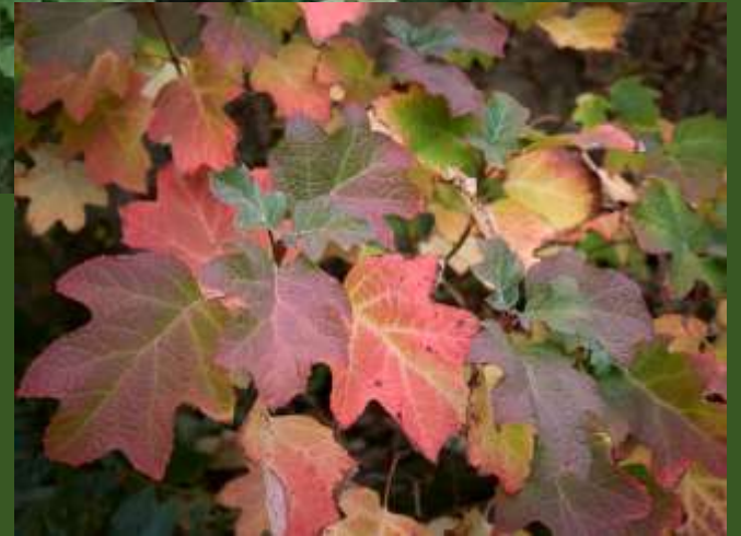
Ruby Slippers Oakleaf Hydrangea Hydrangea quercifolia 'Ruby Slippers'