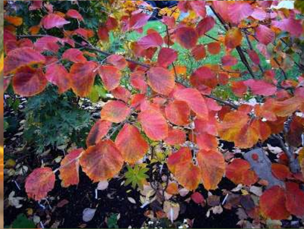
Common Witch Hazel Hamamelis virginiana