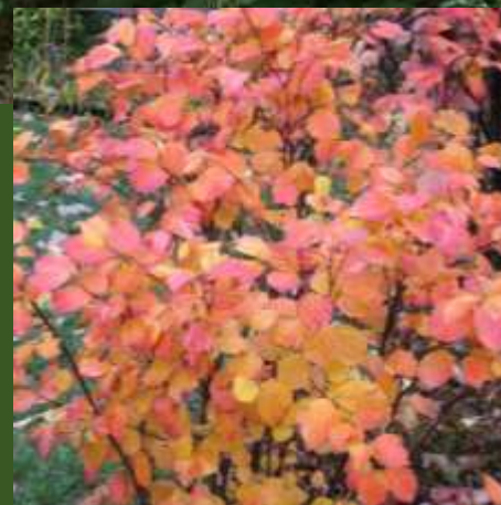
Mt Airy Fothergilla Fothergilla x 'Mt Airy'