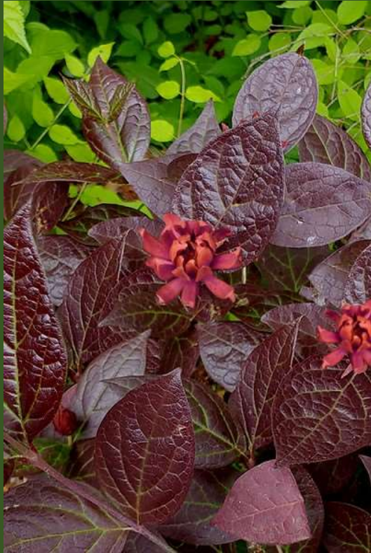
Burgundy Spice Sweetshrub Calycanthus floridus var. purpureus 'Burgundy Spice'