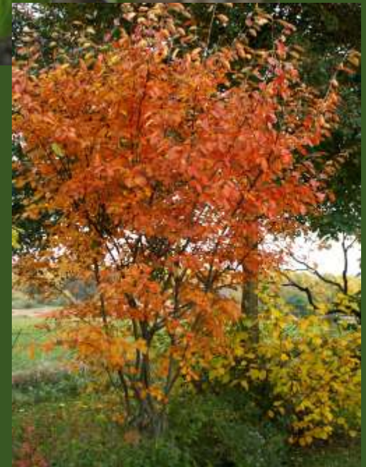
Autumn Brilliance Serviceberry Amelanchier x grandiflora 'Autumn Brilliance'