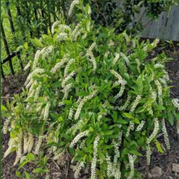
Dwarf Virginia Sweetspire Itea virginica 'Little Henry'