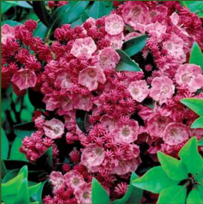
Red Mountain Laurel Kalmia latifolia 'Sarah'