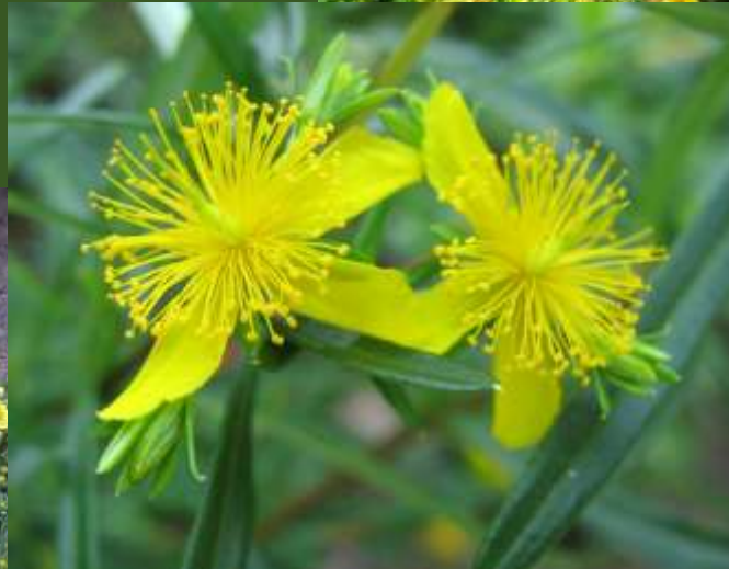
Bushy St John's Wort Hypericum densiflorum