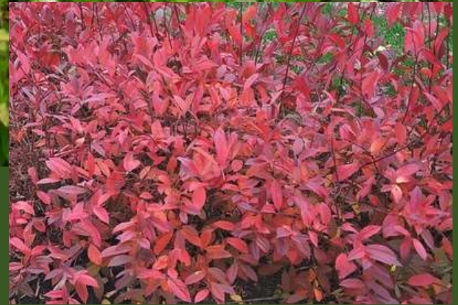
Virginia Sweetspire Itea virginica 'Henry's Garnet'