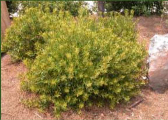
Don's Dwarf Wax Myrtle Morella cerifera 'Don's Dwarf'