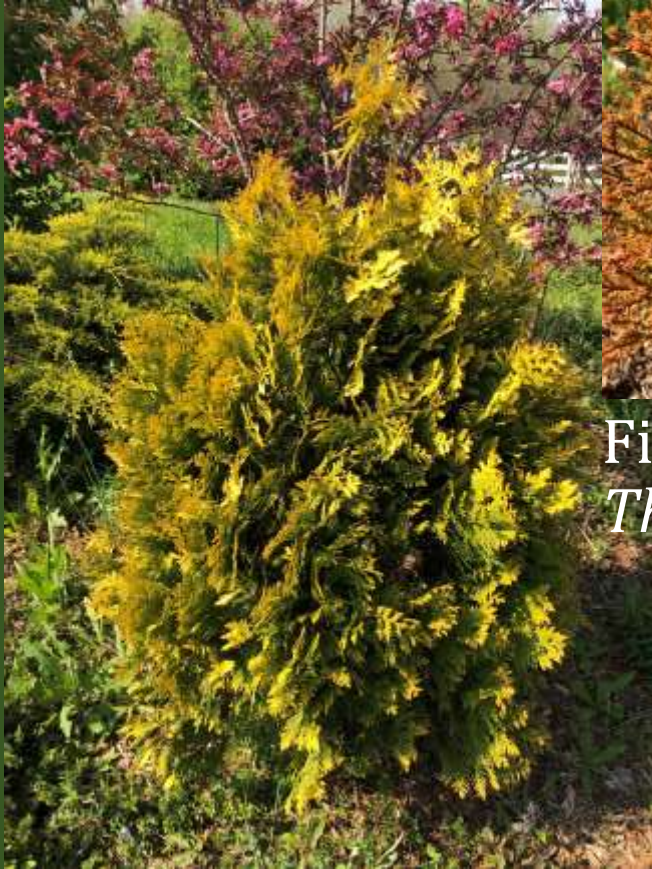
Golden Globe Arborvitae Thuja occidentalis 'Golden Globe'