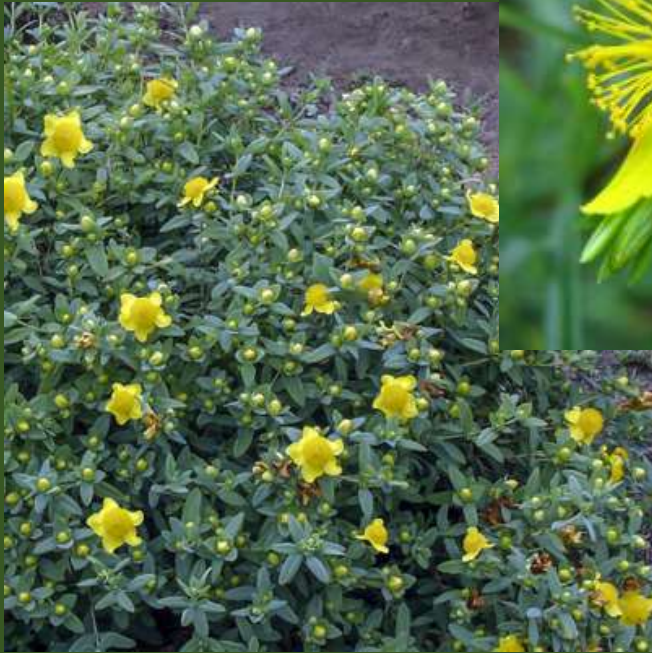
Sunburst St John's Wort Hypericum frondosum 'Sunburst'