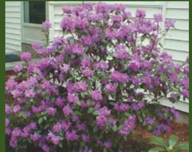
PJM Rhododendron Rhododendron x 'PJM'