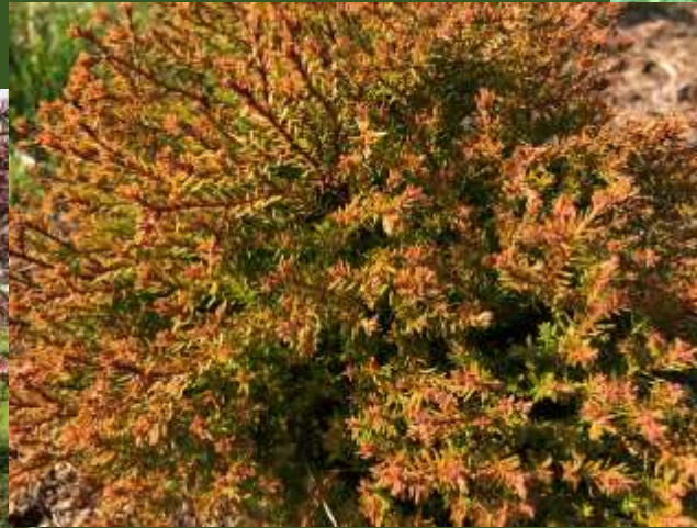
Firechief™ Arborvitae Thuja occidentalis 'Congabe'