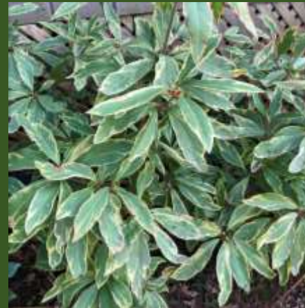
Pink Frost Anise Illicium floridanum 'Pink Frost'