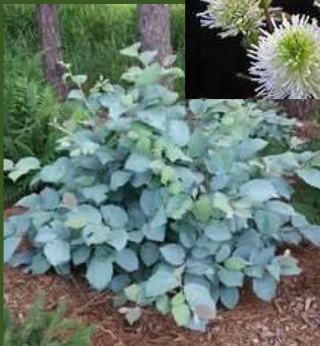
Blue Shadows Dwarf Fothergilla Fothergilla gardenia 'Blue Shadows'