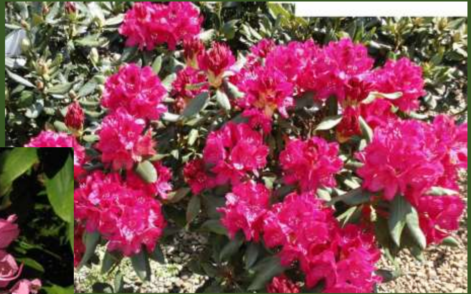
Nova Zembla Rhododendron Rhododendron catawbiense 'Nova Zembla'