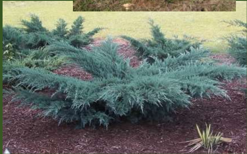
Grey Owl Juniper Juniperus virginiana 'Grey Owl'