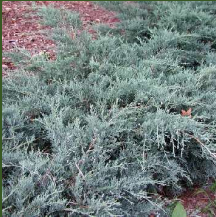
Grey Guardian Juniper Juniperus virginiana 'Greguard'