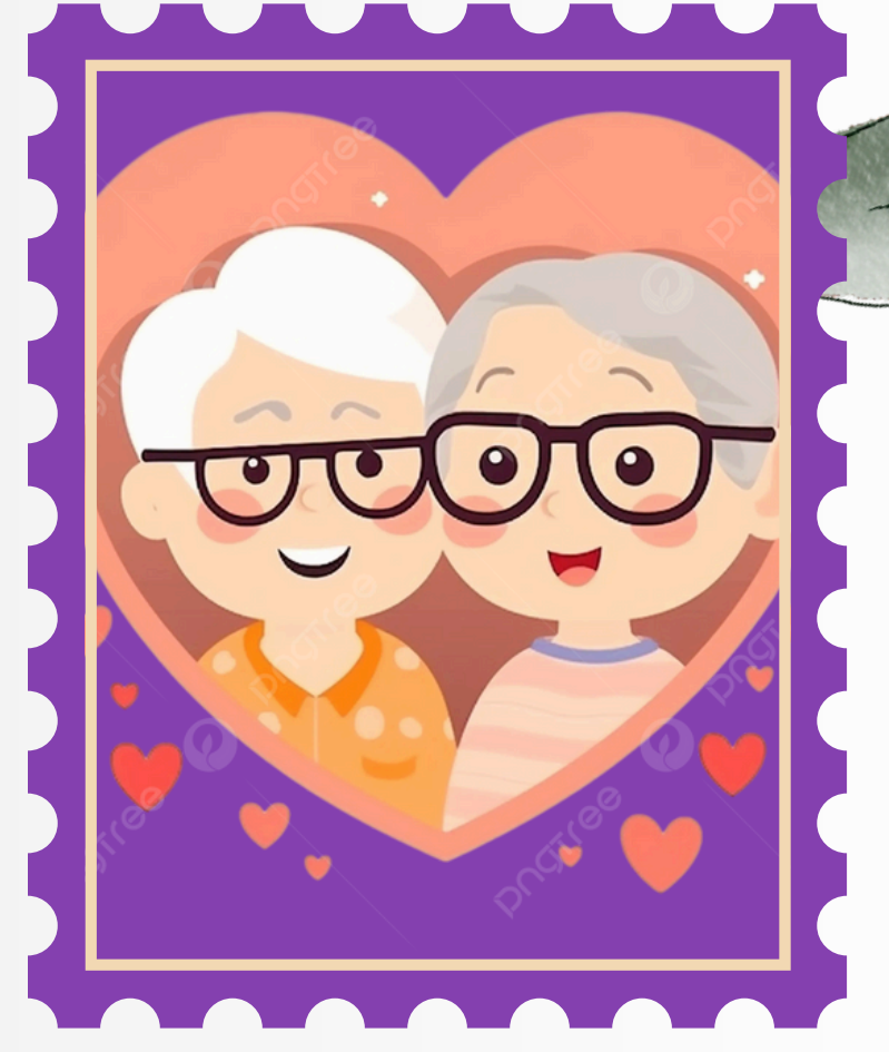
Spending Time with Granchildren